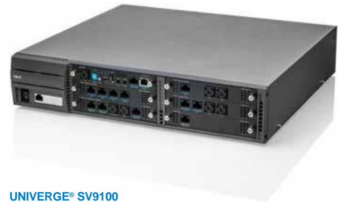
UNIVERGE® SV9100 Free MyCalls Desktop Lite

FREE with every SV9100 - a slimmed down version of MyCalls Desktop – this offers similar functionality bar, presence and 10 as opposed to 1000 DSS (Speed Dial & Busy Lamp Field) keys.