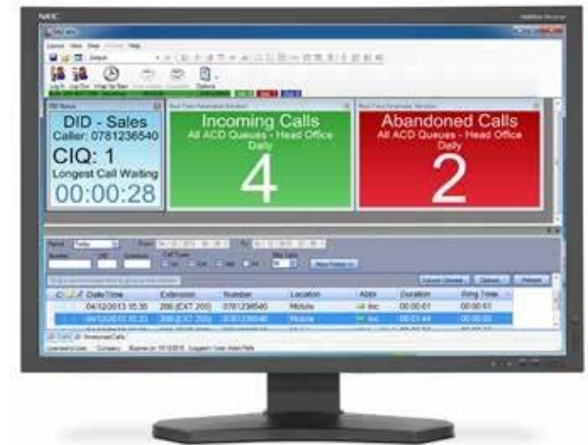
A real-time snapshot of all personal call activity including agent status, call history plus a mini wallboard of group activity

“Allows even a small team to deal with fluctuating call traffic”