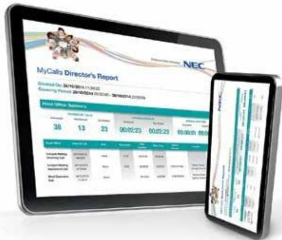
MyCalls Director's Report - key call performance summary can be automatically emailed as a PDF to an MD

This leaves busy managers free to concentrate on their everyday tasks until an alert requires their attention and action. Similarly, call costs are reduced because alarms can be set to flag unauthorized calls, particularly to high cost premium rate numbers, international calls and to mobiles.