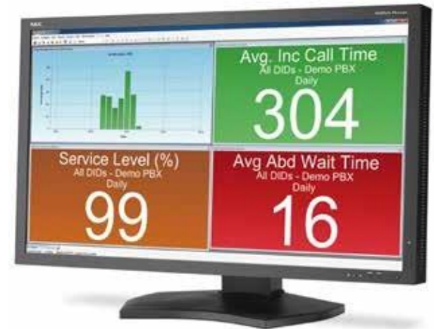
A complete overview of call activity is presented at a glance on screen or wallboard

MyCalls can be programmed to alert a manager when a particular set rule has been broken. For example, if a call has gone unanswered for over 30 seconds, or when abandoned calls exceed a set level.